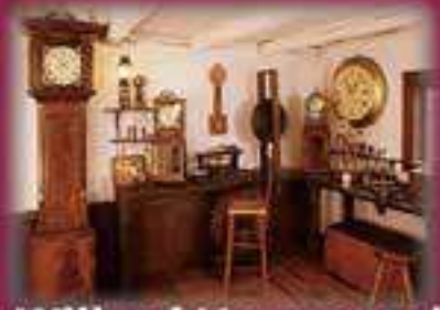
Willard House and Clock Museum