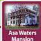
Asa Waters Mansion