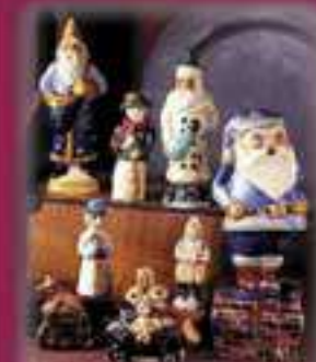
Vaillancourt Folk Art