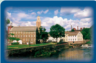
Slater Mill Historic Site