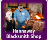
Hannaway Blacksmith Shop