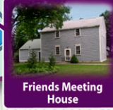
Friends Meeting House