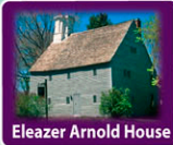
Eleazer Arnold House