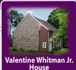
Valentine Whitman Jr. House

Optional Stops: Blackstone River State Park & Bikeway Lincoln Woods State Park Lodge Pub & Eatery Lime Rock Village